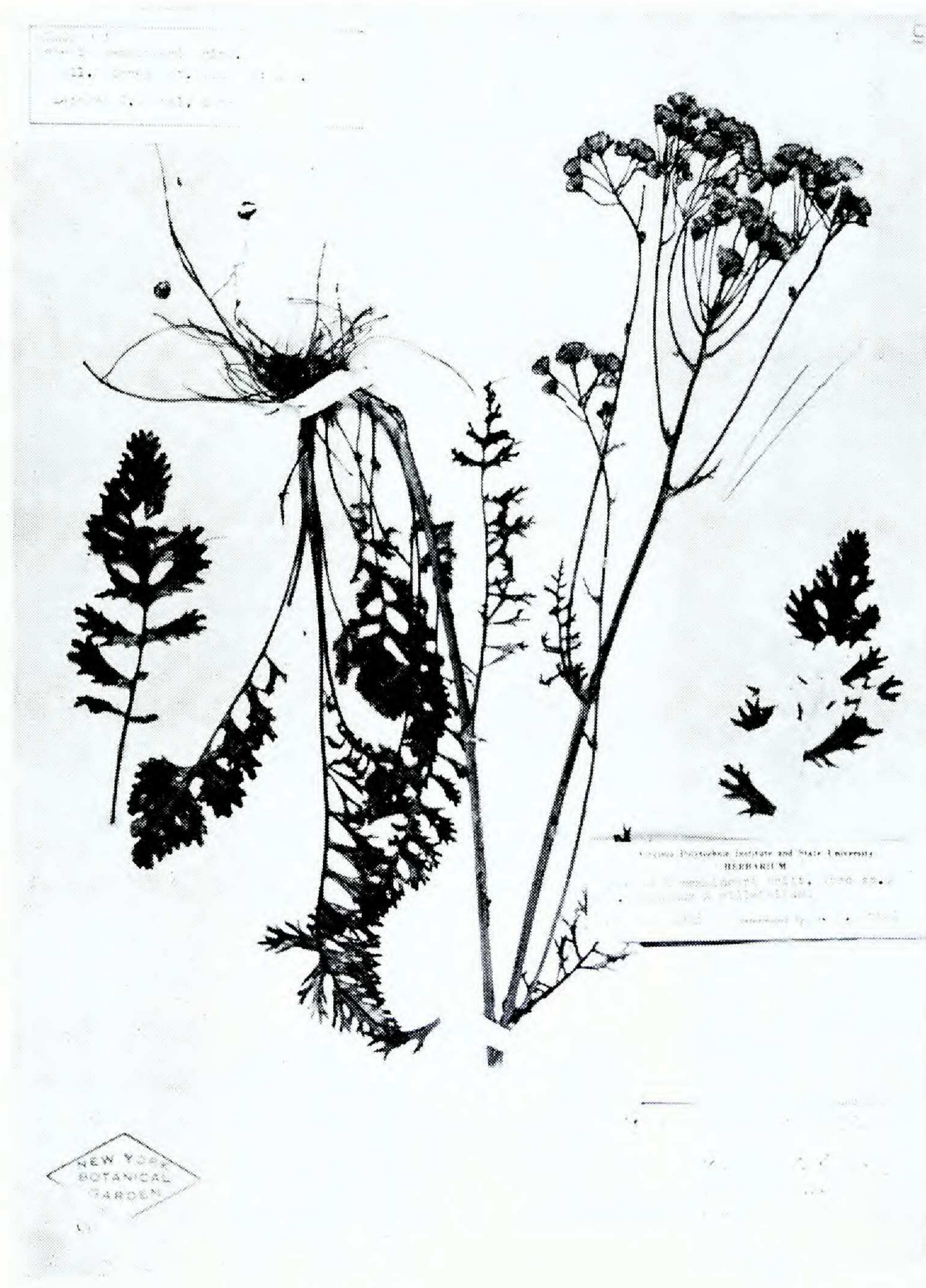
Figure 2. Senecio memmingeri , holotype (Memminger s.n., NY), S. \times memmingeri (pro sp.) ( S. anonymus \times millefolium ).